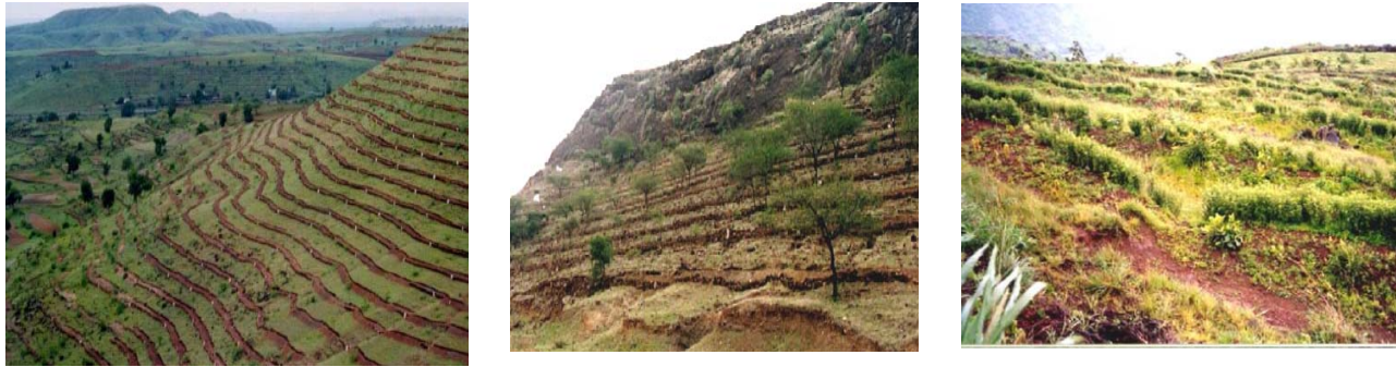
(a) Continuous contour trenches (b) Stone Bunds across the slope (c) Vegetation Bunds and plantations along CCTs

of vegetated stone-soil bunds, offer safety to cultivated lands at the valley bottoms. In the Farta Woreda which is closer to Fogera Woreda paved and grassed water way technology is practiced in 34 kebeles as an effective mechanism to trap and direct rainwater to natural drainage systems safely. The technology was found to be suitable to steeper areas receiving high rainfall to enhance moisture and water harvesting, effective soil erosion control and prevention of gully erosion (SLMP, 2010).